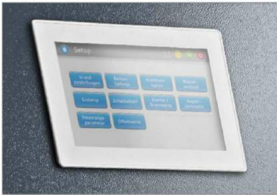
Optional SCT controller with 7" touch screen