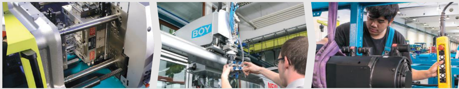
Great distances between tie bars and platens for mounting larger moulds